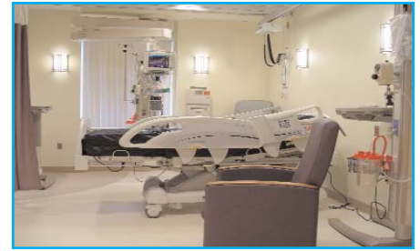
ICU Patient Room

While this year's "big news" at DuBois Regional Medical Center is not just about doctors, physician recruitment is vitally important. The 2009 recruitment class was the largest in DRMC history, with sixteen new physicians joining the Medical Staff in the last twelve months. Among the specialties represented are pediatrics, emergency medicine, psychiatry (including pediatric, adult, and geriatric), gastroenterology, cardiology, anesthesia, general surgery, pathology, family practice, general and orthopedic surgery, ophthalmology, and obstetrics/gynecology. Over the last three years, 43 physicians have become part of DRMC's medical community. More doctors means improved access to medical care, and that's a very good thing. That means the medical center can continue to grow to provide more and better services for everyone in the area.